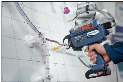
Operated by battery with cable ties on a reel from overhead suspension