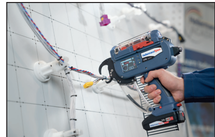
Operated by battery with cable tie bandolier