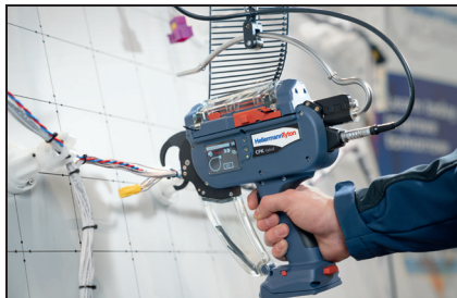
Operated by power supply

You have the choice: cordless operation with rechargeable battery pack, corded with AC power, or a combination of both.