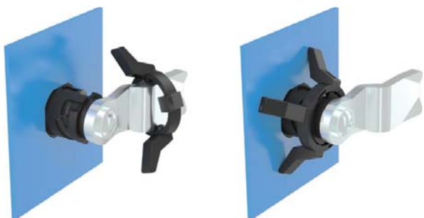
Easy mounting - without tool with special plastic nut