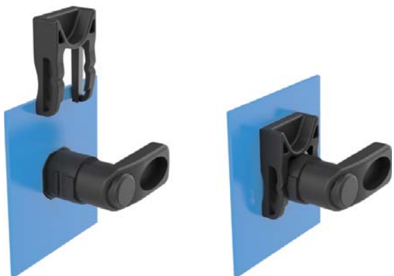
Easy mounting - without tool with plastic clips