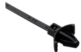
One-piece with wings