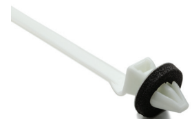
One-piece with foam or TPE seal